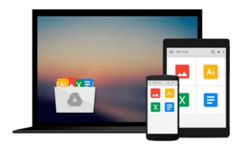
H2O, Issue 3